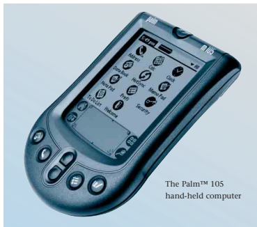
The Palm™ 105 hand-held computer

just log on... and you could win a Palm hand-held Computer